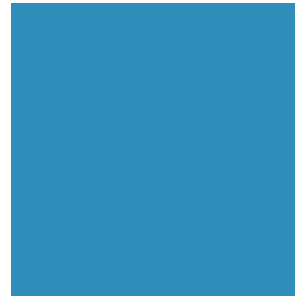
9009S Cobalt Blue