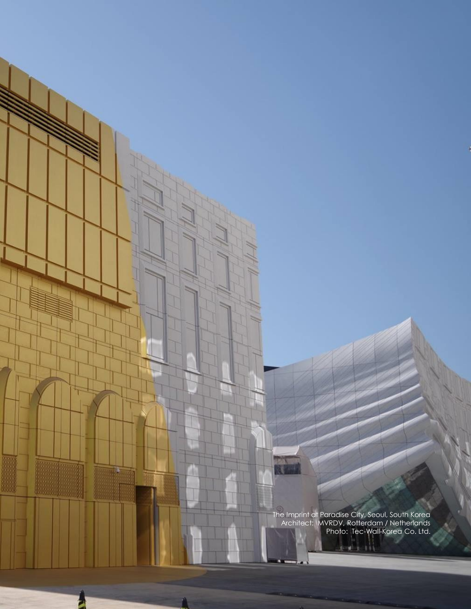
The Imprint at Paradise City, Seoul, South Korea Architect: MVRDV, Rotterdam / Netherlands