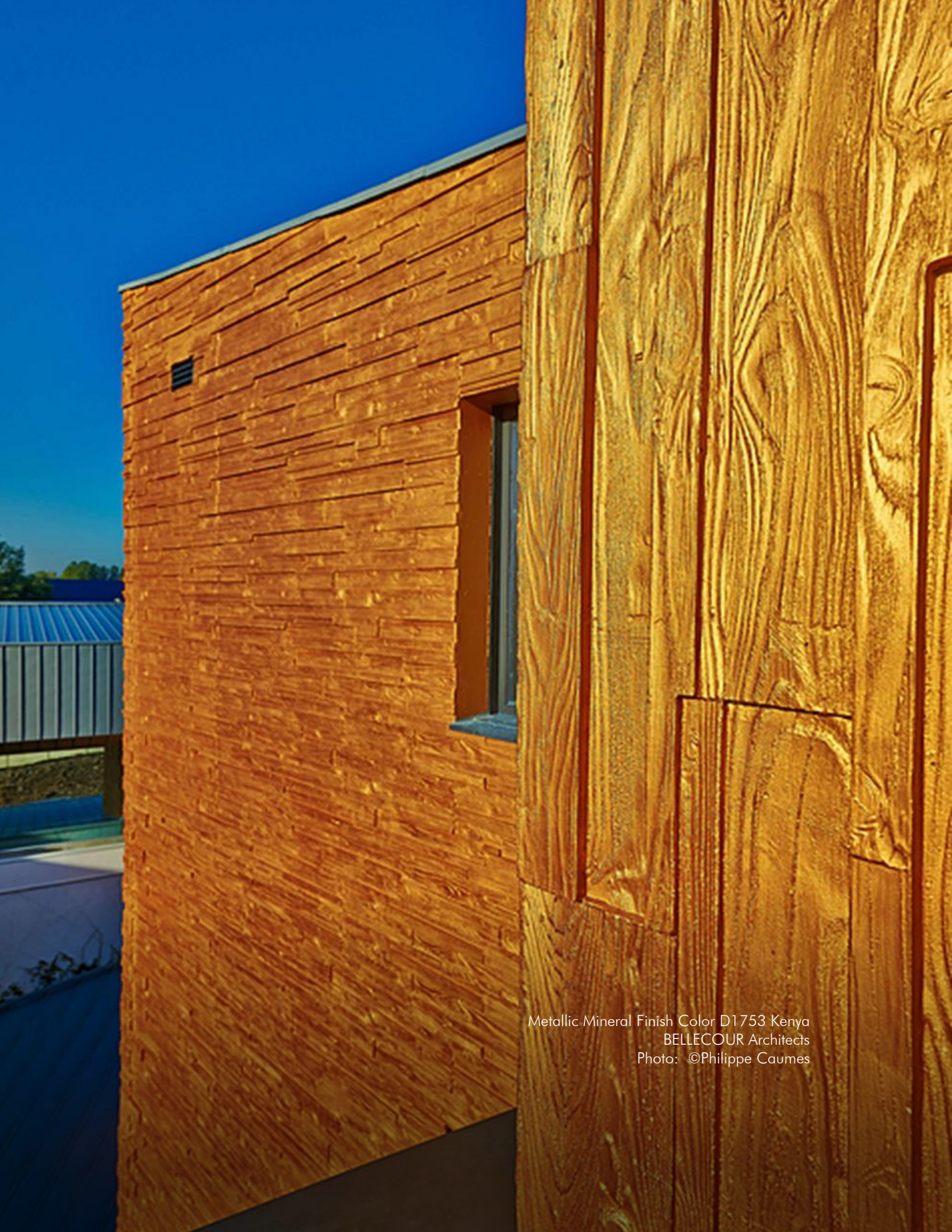
Metallic Mineral Finish Color D1753 Kenya BELLECOUR Architects