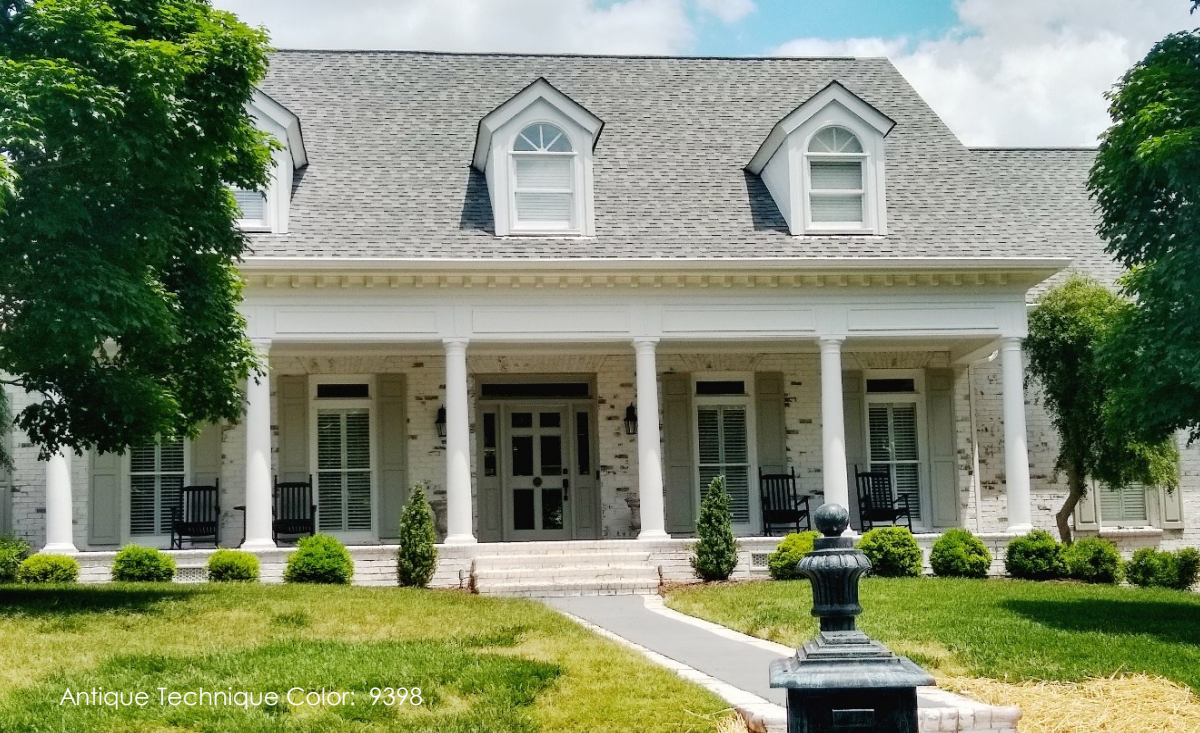
Antique Technique Color: 9398