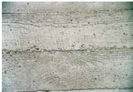
Low-pigment finish (without filler), blowholes remain open