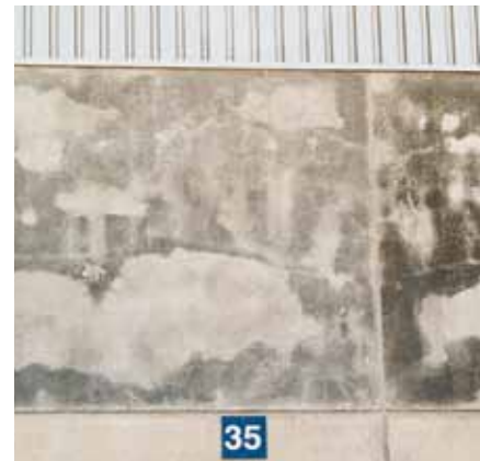
Example A Low-pigment finish, highly diluted