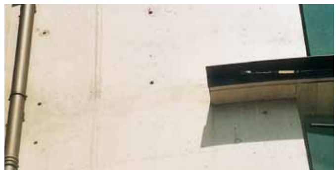
Filled areas either largely toned down or complete mineral color-matched finish