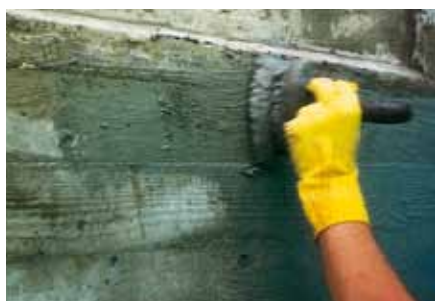
Blowhole grouts, brushed on, coarse board formwork texture retained