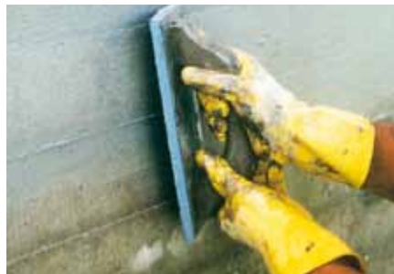
Scratch filler, applied with sponge float or hard rubber float Board formwork texture retained