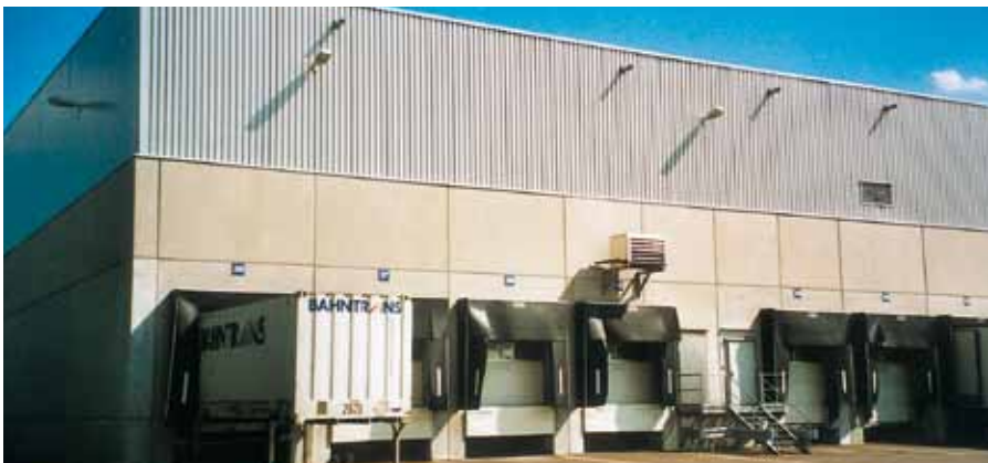
Homogeneous, well-balanced appearance after completion of the mineral treatment with KEIM Concretal-Lasur