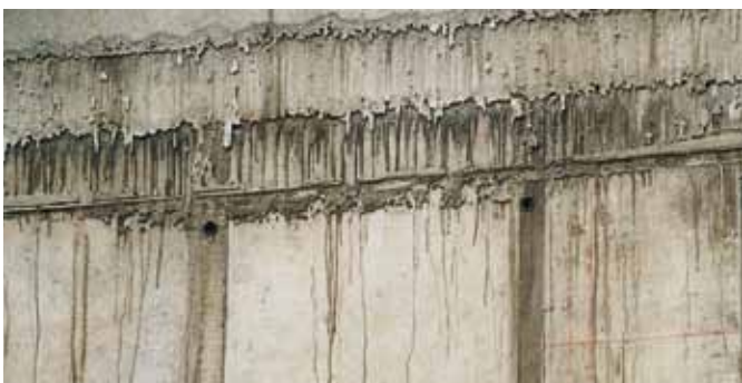
New concrete with laying defects requiring subsequent filling