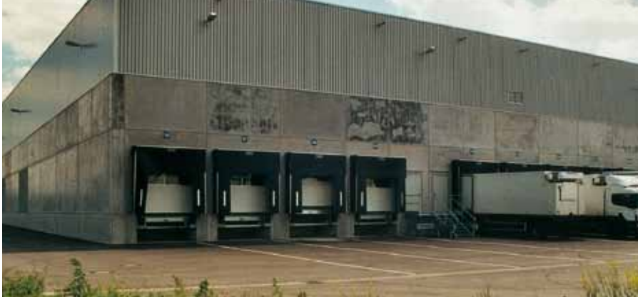
Uneven, unattractive appearance

Objective: To create a homogeneous appearance by discreet mineral color-matching of individual areas, depending on the severity of the blemishes.