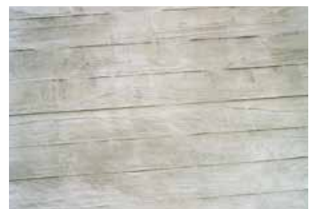
Board formwork texture reproduced in repaired areas