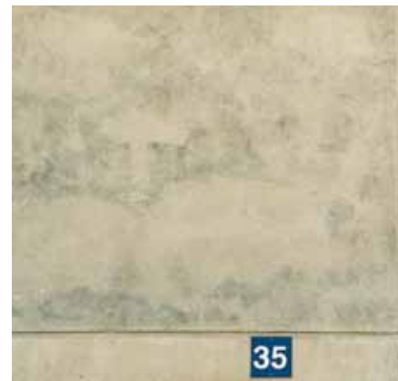
Example B Low-pigment finish, less highly diluted