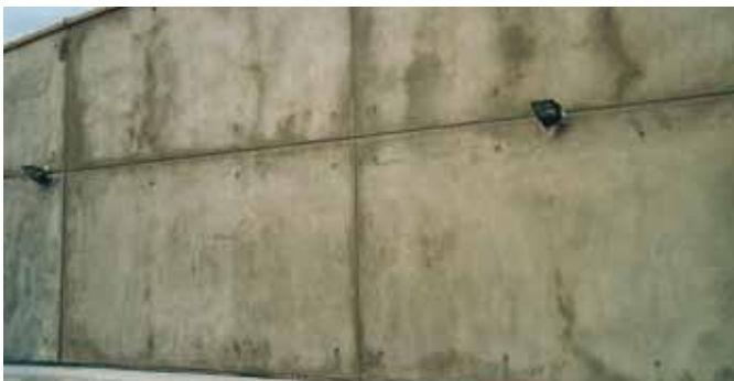
New concrete with severe blemishes