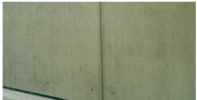
Blemishes either largely toned down or complete mineral color-matched finish