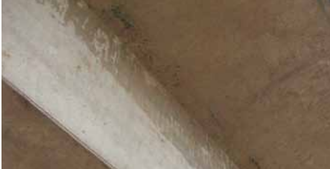
New concrete with slight blemishes