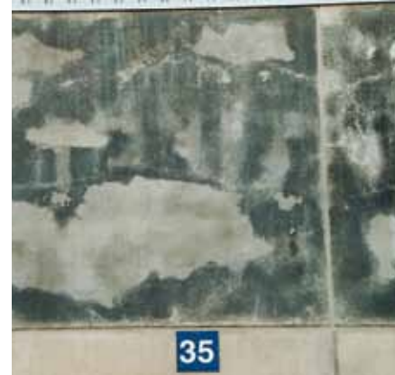
Extremely severe blemishes in the area of bay 35