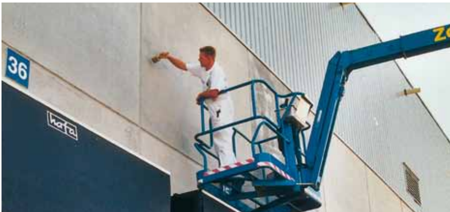
KEIM service technician at work