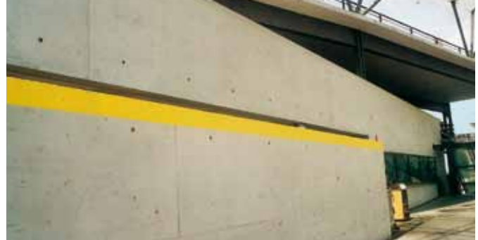
Uniform mineral surface with KEIM Concretal-Lasur